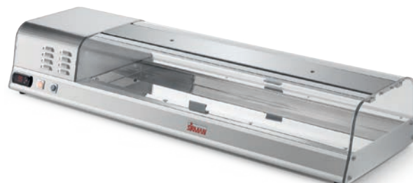
VISTA EASYCOLD 130