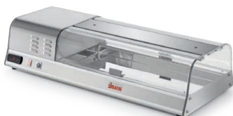
VISTA EASYCOLD 100