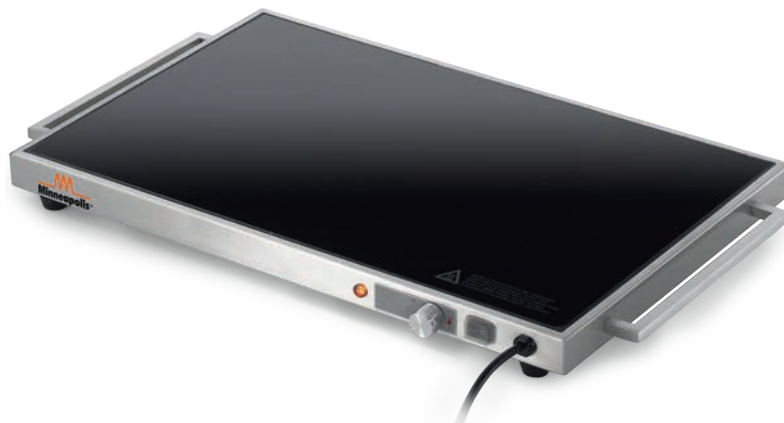
PB 1/1 INOX