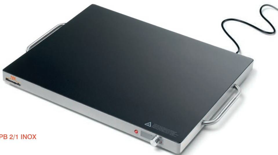
PB 2/1 INOX