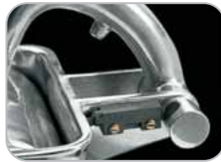
Microinterruttore su leva Micro-switch on lever