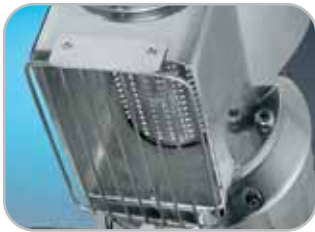
Griglia di protezione/rullo inox Protection grate/stainless steel drum